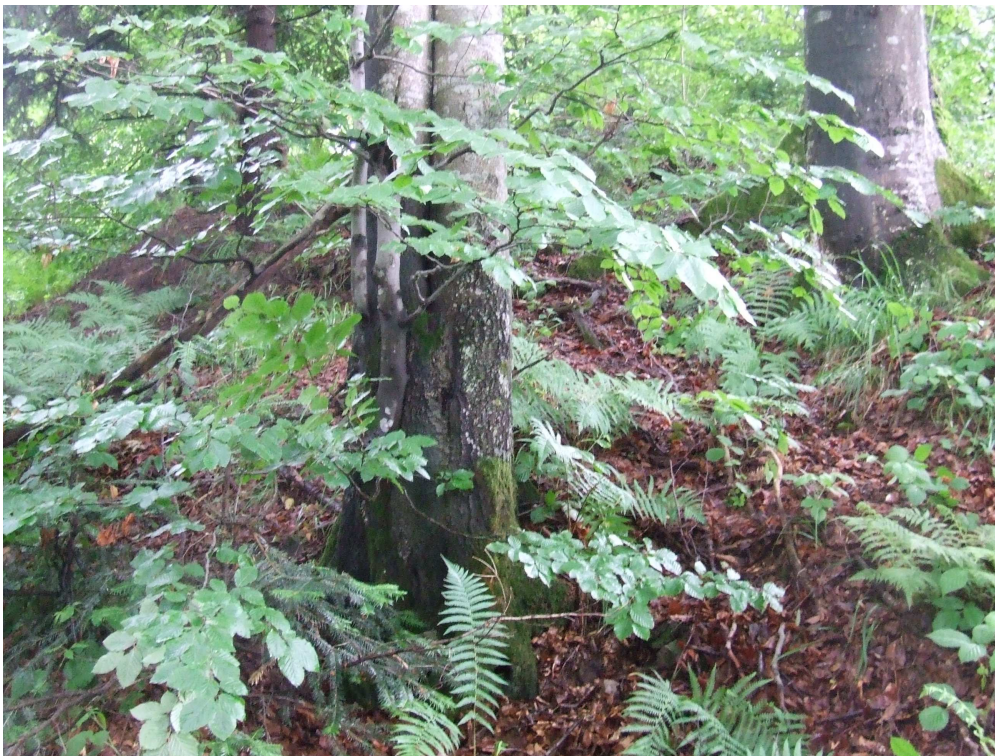
Fig. 2. Beech forest near the summit of Mt Patryja – site of Anacamptodon splachnoides (photo by A. Stebel, 16 June 2015).