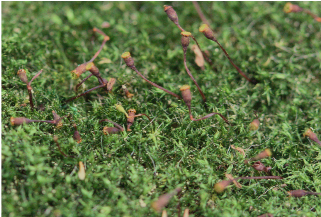
Fig. 1. Habitus of Anacamptodon splachnoides.