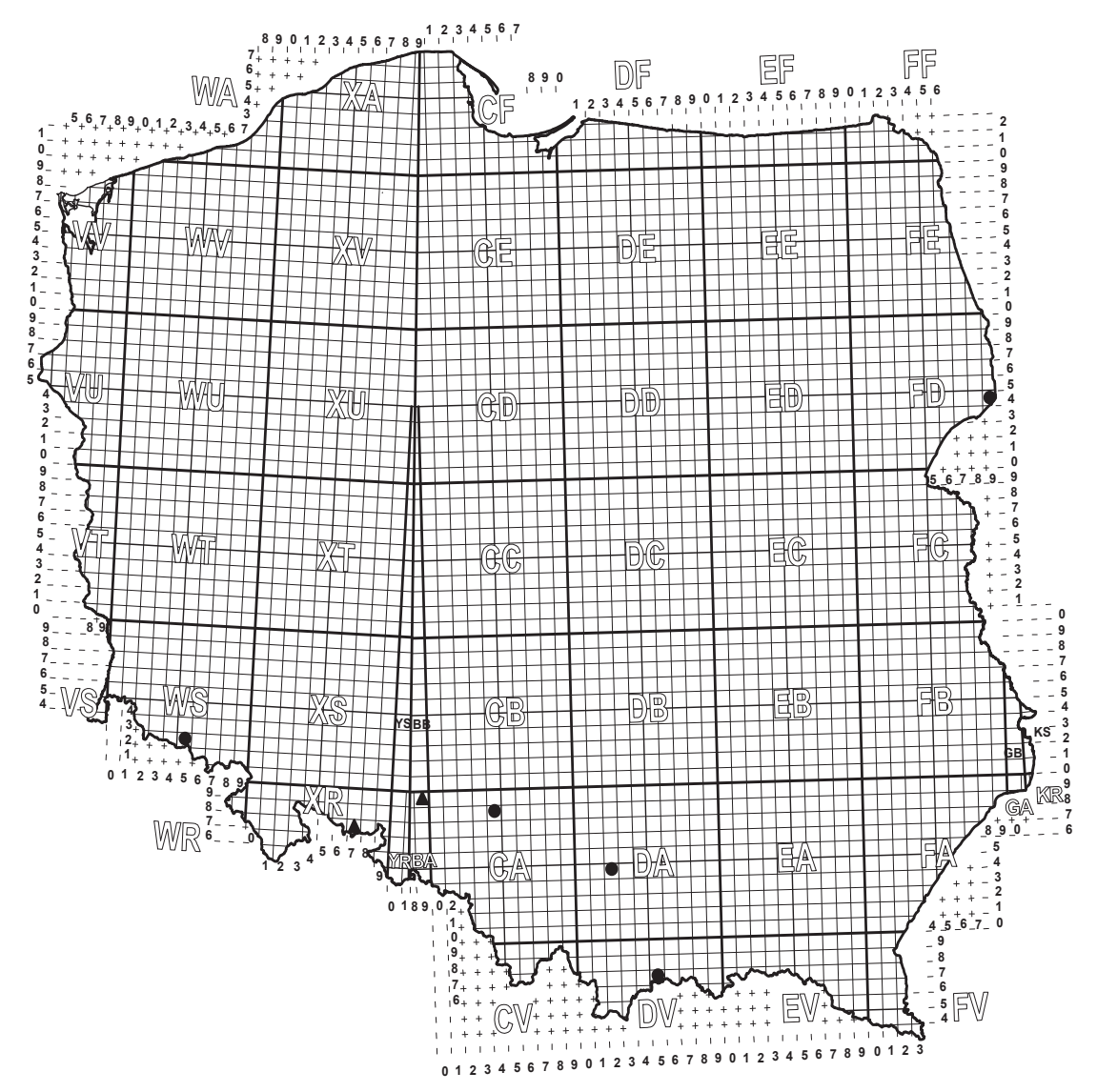
Fig. 2. Distribution of Micromus lanosus (Zelený, 1962) in Poland. New localities (triangles), localities from literature (spots).

M. lanosus was noted in Poland from the middle of July to the second half of September. Three specimens of the five, for which collecting dates are known, have been collected between July 12 and July 19. Peak of imago activity and comparatively high frequency in July and early August are regular features of its seasonal phenology, but September records are exceptionally rare (second generation?) (Aspöck et al. 1980; Tröger 2007).