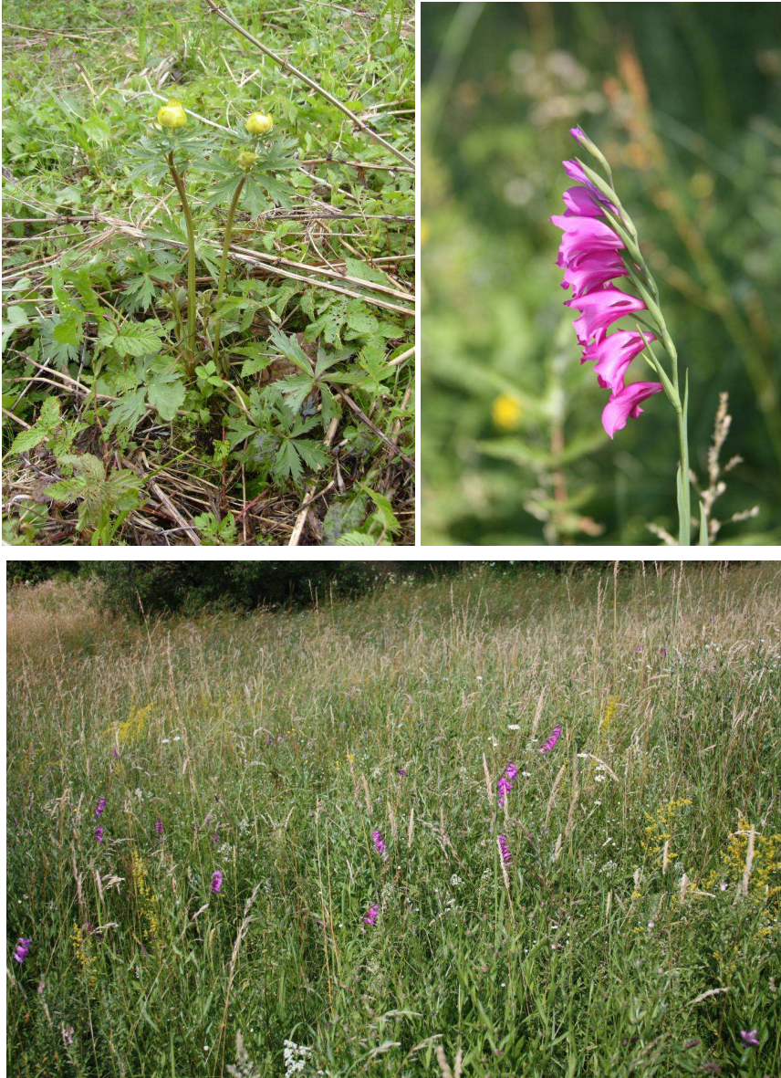
Fig. 2. Clump of Trollius europaeus and Gladiolus imbricatus at Góra Napoleona